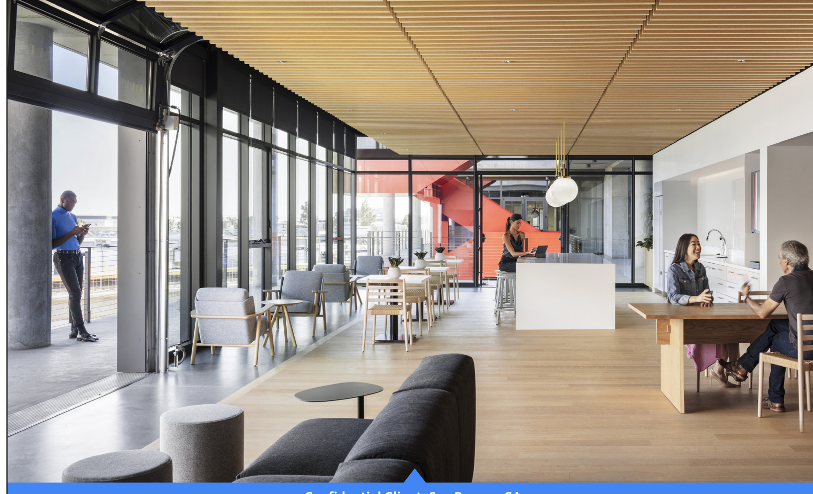
Confidential Client, San Ramon, CA